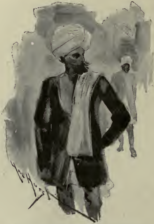
HE WAS EXTREMELY DIGNIFIED

but he never by any chance did as he was told. Add to this the fact that he was extremely dignified and distinguished-looking,